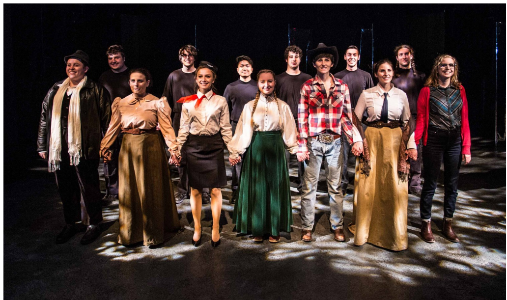
The full cast of Anton in Show Business