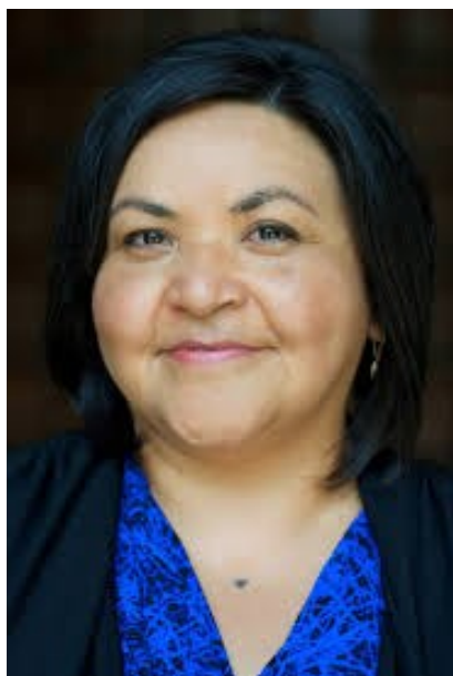
EDEN ROBINSON

After being introduced with a prayer and chant, Eden Robinson took the floor in front of an especially large audience at the K.C. Irving Centre auditorium. Because she had been introduced as unafraid of “confronting the bleaker parts of life” in her books, it was surprising and refreshing when she began to speaking in a cheerful but down-to-earth way and punctuating her sentences with whole-hearted laughter.